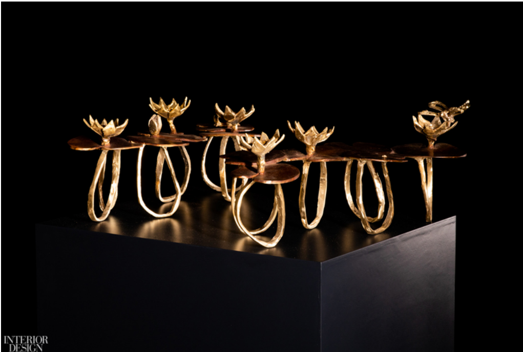
Lily pad candleholders, c. 2020 by Paula Swinnen.

Artists and designers have always turned constraints into opportunities of innovation. Throughout this pandemic, many galleries and showrooms have had to rethink how the public can access their collections of artwork. Bernd Goeckler ( https://www.bgoecklerantiques.com/ ), an art dealership renowned for antiques that's been an industry favorite for over three decades, is unveiling its virtual viewing room with an exhibition spotlighting the beauty of bronze.