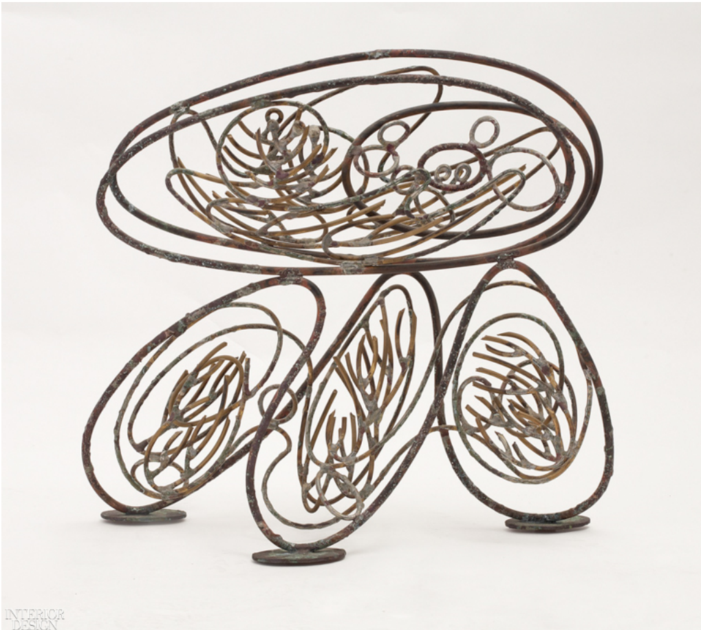
"Untitled" sculpture c. 1970 by Richard Filipowski.