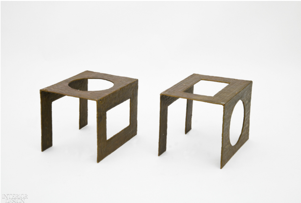
Pair of side tables, c. 1960 by Costa Couletianos.

A new level of participation between design dealers and art enthusiasts is achieved in embracing the new non-physical exhibition, injecting a new energy into New York City's art world. By following the same aesthetic narrative, these neighboring galleries are able to relate to each other in a way that shows under one big tent often do not allow for. This storytelling and collaborative approach to exhibitions is perhaps a forecast into how galleries will continue to present during and after the pandemic.