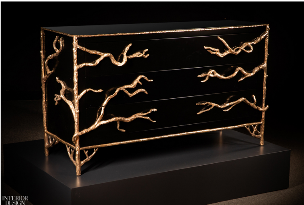
Antique commode with matte black lacquered wooden body.

A new level of participation between design dealers and art enthusiasts is achieved in embracing the new non-physical exhibition, injecting a new energy into New York City's art world. By following the same aesthetic narrative, these neighboring galleries are able to relate to each other in a way that shows under one big tent often do not allow for. This storytelling and collaborative approach to exhibitions is perhaps a forecast into how galleries will continue to present during and after the pandemic.