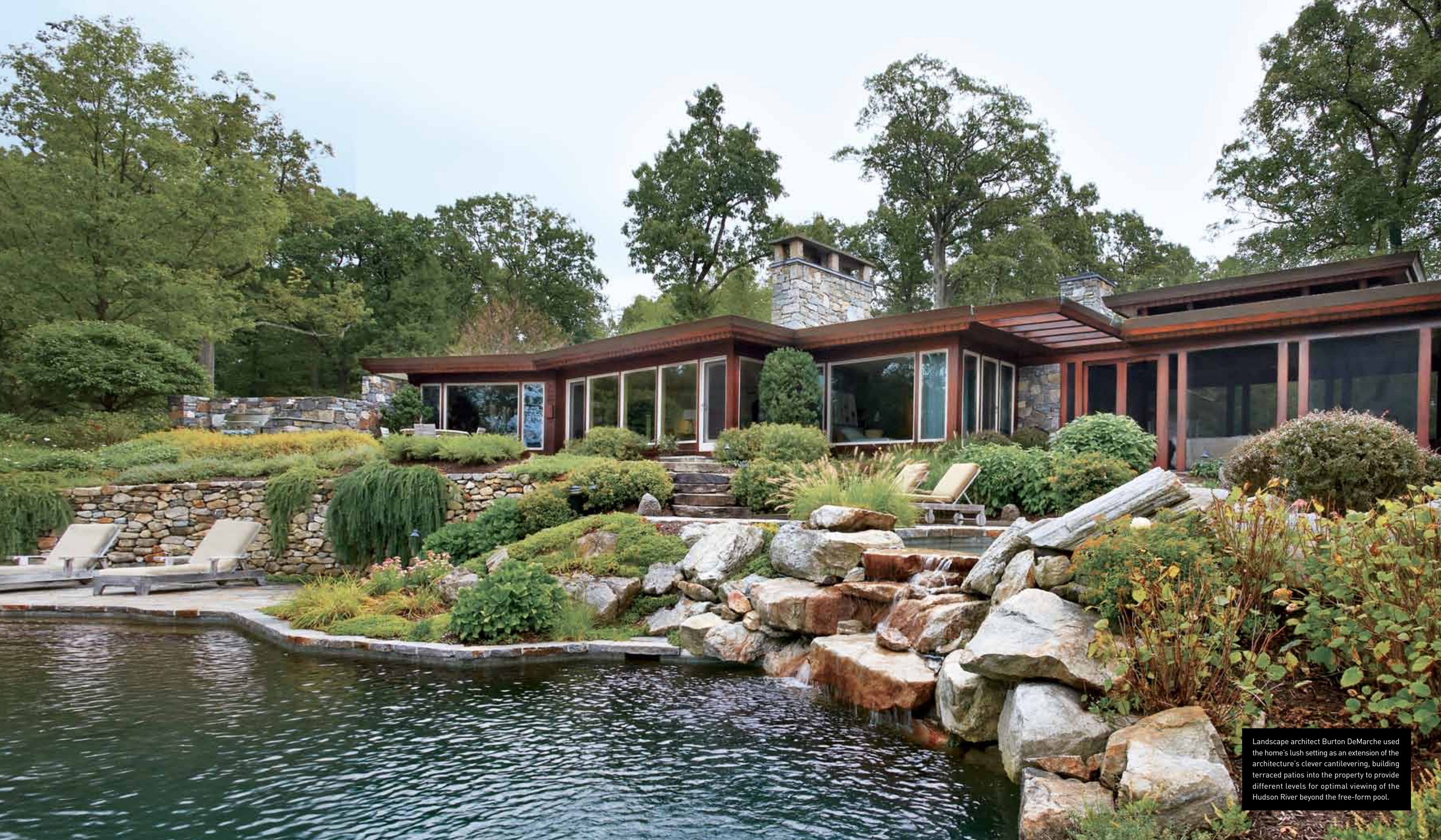
Landscape architect Burton DeMarche used the home's lush setting as an extension of the architecture's clever cantilevering, building terraced patios into the property to provide different levels for optimal viewing of the Hudson River beyond the free-form pool.