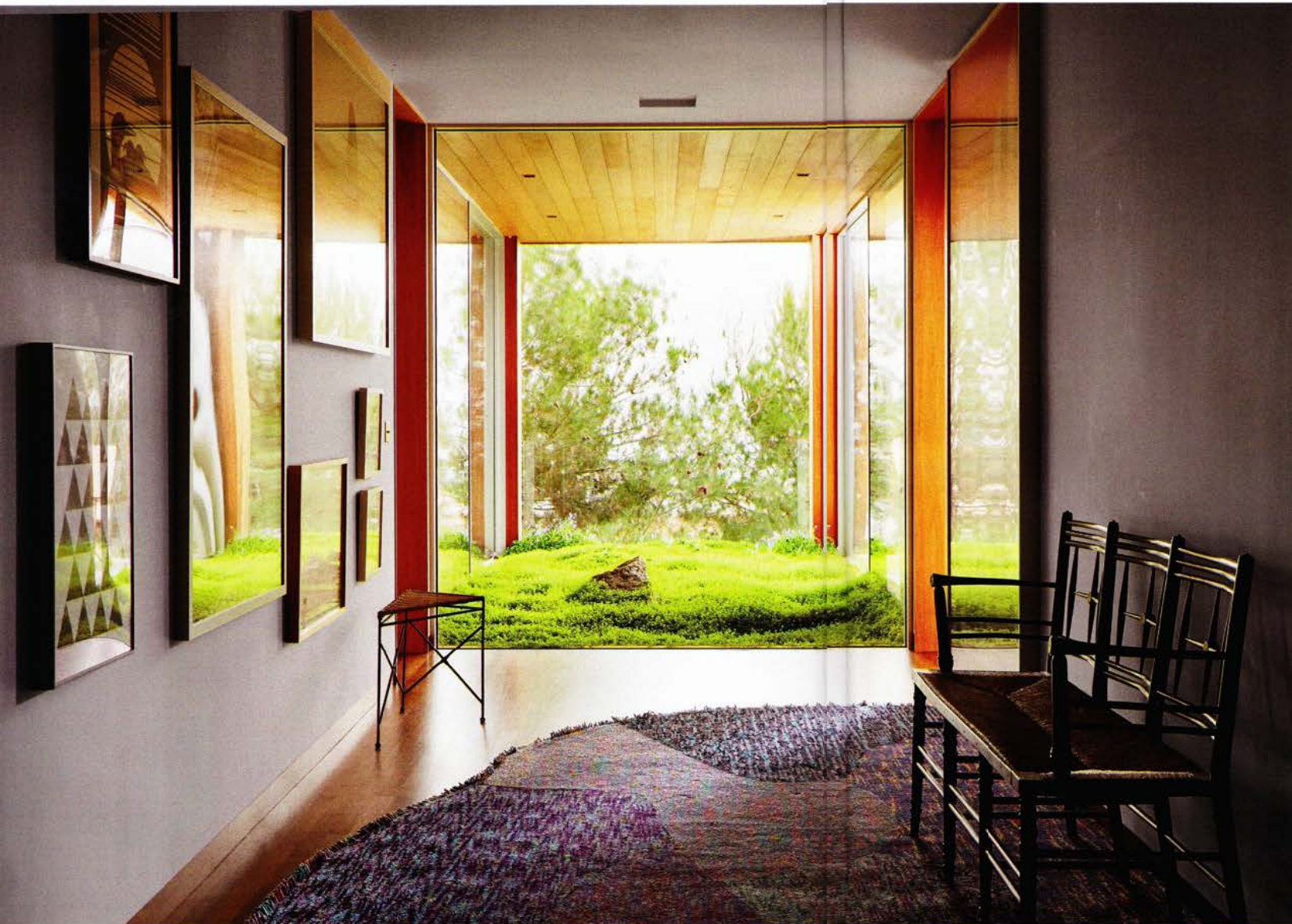
A HALLWAY LEADS TO A SEMI-CONTAINED MOSS GARDEN. WICKER STOOL BY FABIEN CAPPELLO; ANTIQUE BEECH SETTEE; CUSTOM RUG BY MAX LAMB.

small work station. Floating within the open expanse is an ever-changing landscape of toothsome vintage furnishings by the likes of Gio Ponti, Ward Bennett, Joe Colombo, Maurice Dufrene, and Pierre Chapo, all set atop a sprawling carpet of abaca tiles. A custom de Gournay wallpaper of pine trees in fog, as delicate as a Japanese ink drawing, lines the bar interior.