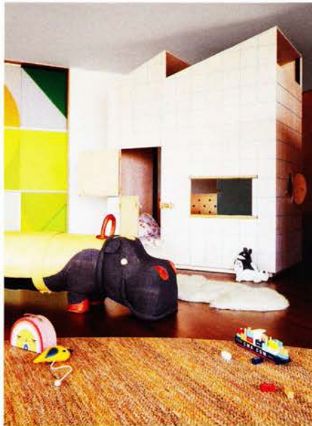
ABOVE, FROM LEFT THE POWDER ROOM FEATURES A HAND-CARVED ELM SINK; BLACK LACQUERED ROSEWOOD PANELING ON WALLS. A HIPPO TOY BY RENATE MÜLLER STANDS WATCH IN FRONT OF A FREESTANDING PLYWOOD SLEEPING POD IN THE KIDS' ROOM. BELOW, FROM LEFT GLIMPSED THROUGH A PORTHOLE, THE READING NOOK IS DECORATED WITH BENJAMIN MOORE AND PRATT & LAMBERT PAINTS, VINTAGE TEXTILES, AND CUSTOM CASEWORK BY DE LISLE. A BETTY WOODMAN WALL-MOUNTED CERAMIC SCULPTURE OVERLOOKS A PIERRE CHAPO COCKTAIL TABLE.