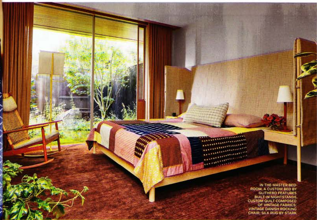
IN THE MASTER BEDROOM, A CUSTOM BED BY GLITHERO FEATURES BUILT-IN NIGHTSTANDS. CUSTOM QUILT COMPOSED OF VINTAGE FABRICS. VINTAGE DANISH ROCKING CHAIR; SILK RUG BY STARK.