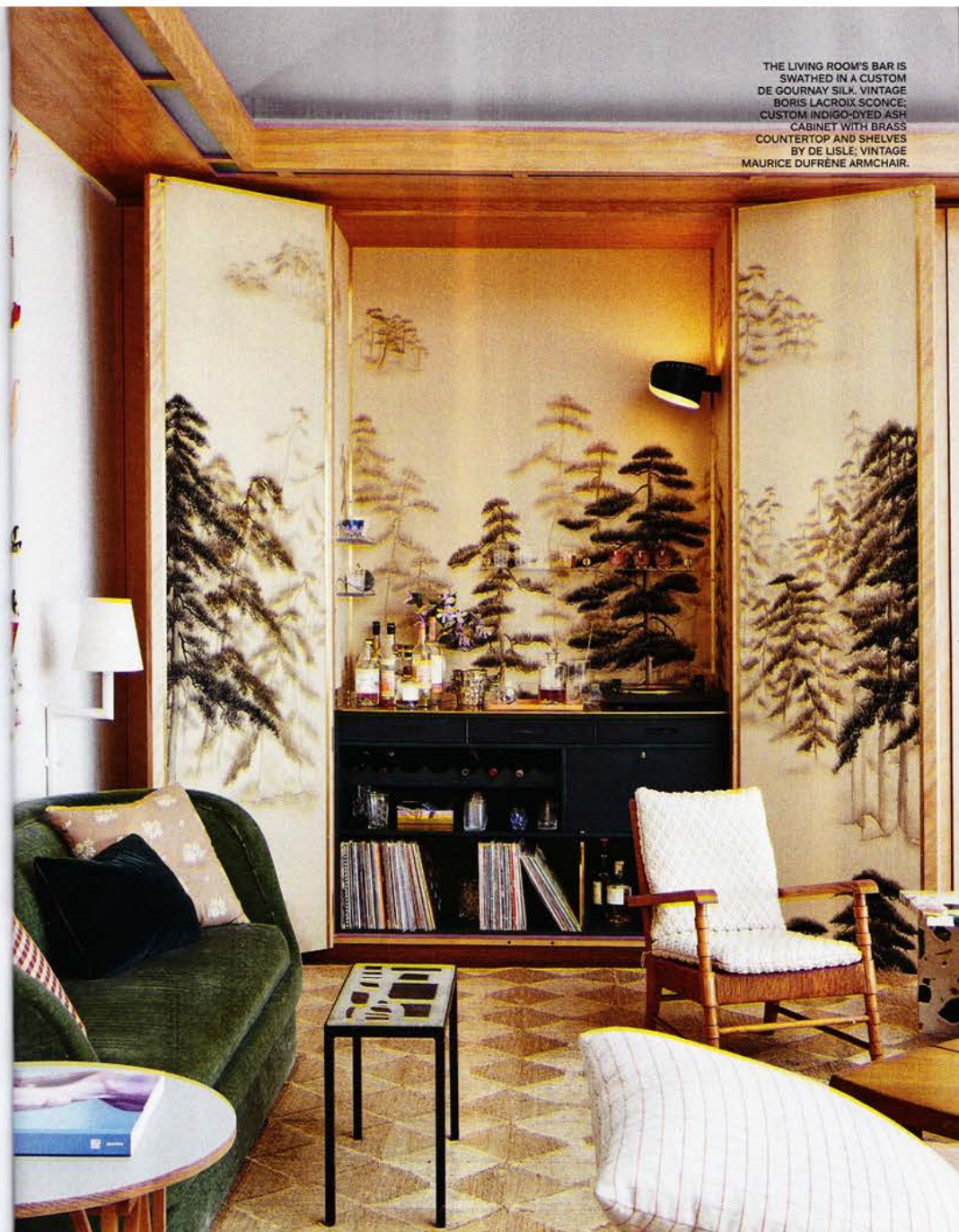
THE LIVING ROOM'S BAR IS SWATHED IN A CUSTOM DE GOURNAY SILK. VINTAGE BORIS LACROIX SCONCE; CUSTOM INDIGO-DYED ASH CABINET WITH BRASS COUNTERTOP AND SHELVES BY DE LISLE; VINTAGE MAURICE DUFRENE ARMCHAIR.

Originally built in 1963, the Sittigs' house is composed of stacked rectilinear volumes of redwood and glass, projecting from a steep San Francisco hillside. The taut modernist structure had barely been touched in the half-century since it arose in